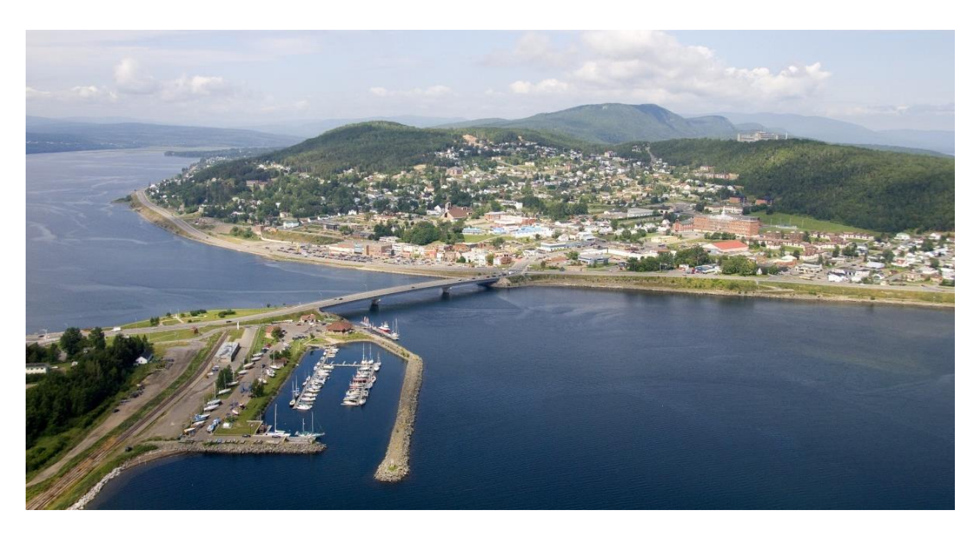
Town of Gaspé, (Québec), Canada

Pavillon des sports du Cegep de la Gaspésie les Îles