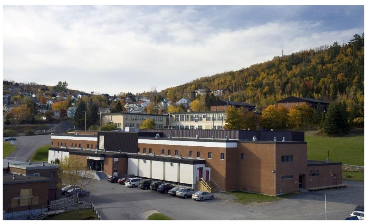
Pavillon des sport Marcel Bujold (back of the big pavillon)